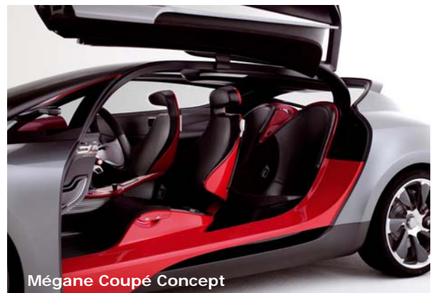
Mégane Coupé Concept

In the UK Renault is in the midst of a product offensive of new vehicle launches which form part of the French marque's three-year plan, 'Commitment 2009', for quality, profitability and growth.